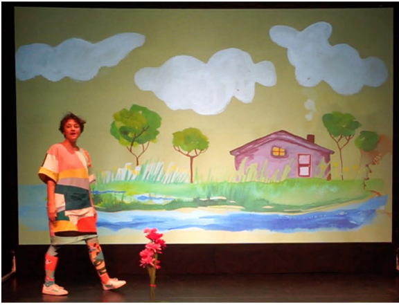
cue 1 show start