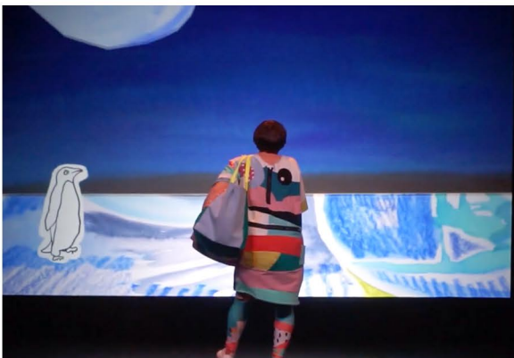
cue 5 / \pm 23rd minute goes with penguin. Transition from night to abstract ice world