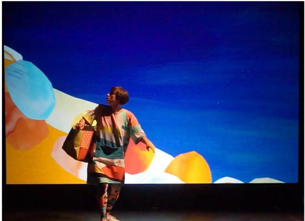
cue 4 / \pm 19th minute passing the blue stone, walking down the mountain