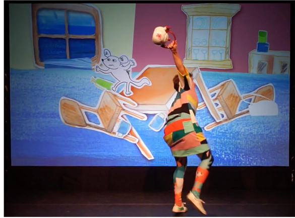
cue 2 / \pm 5th minute furniture starts floating in the water