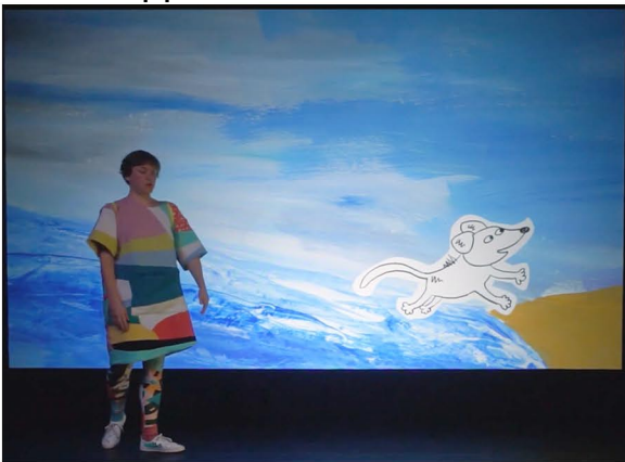
cue 3 / \pm 8th minute beach appears in screen